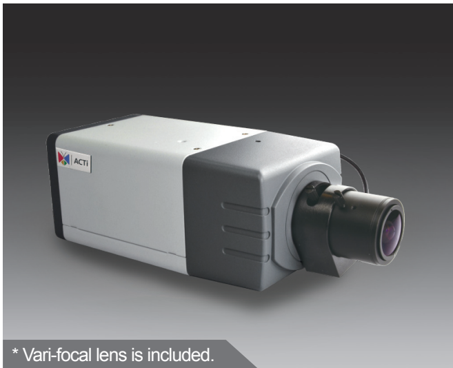
* Vari-focal lens is included.

1.3MP Box with D/N, Basic WDR, SLLS, Vari-focal lens